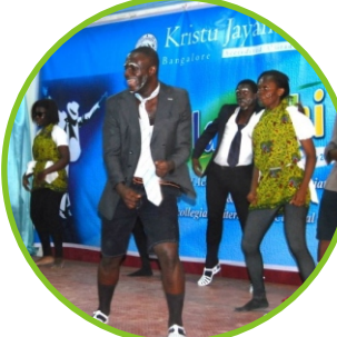
Exams seem easier